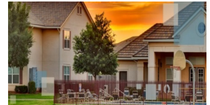
Have a Peachy Keen August Quail Hollow Residents!!!

You can find peaches every Friday in the leasing office to jumpstart your peach kick!